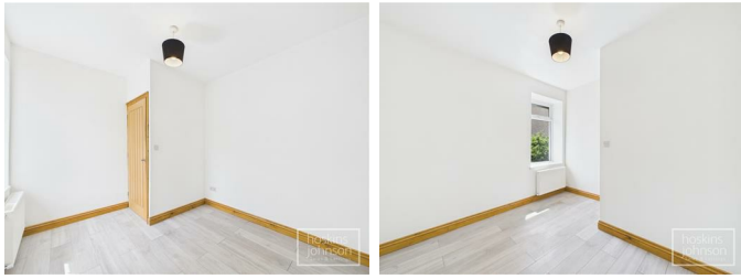
Bedroom 2 10'4" x 9'1" (3.17 x 2.78)

Double glazed window to side, radiator, laminated wood flooring.