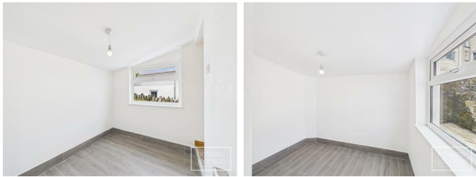
Bedroom 3 8'9" x 6'6" (2.68 x 2.00)

Double glazed window to side, radiator, laminated wood flooring.